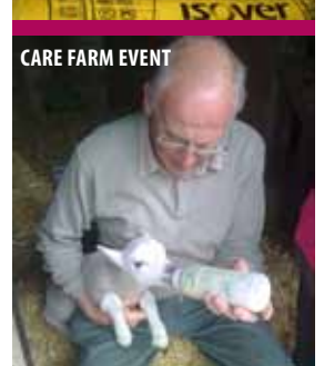
CARE FARM EVENT