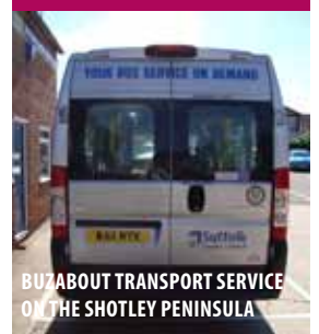
BUY ABOUT TRANSPORT SERVICE ON THE SHOTLEY PENINSULA

And much more!! For advertising opportunities please call 01473 345300